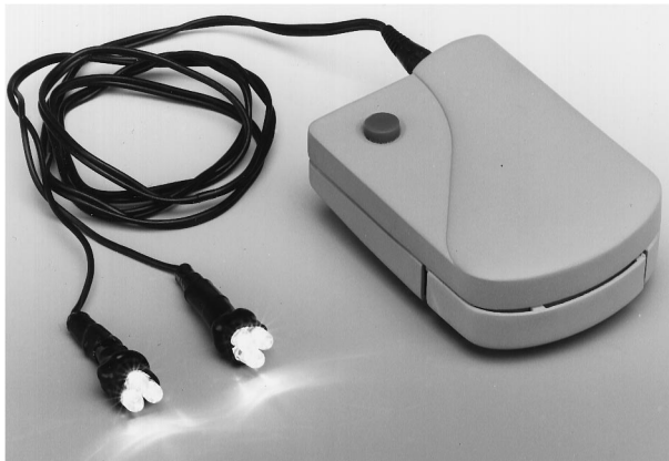
Figure 1. The Bionase unit, consisting of a control box containing the electronic circuit and a battery, and two light-emitting units for intranasal use. Note the push button on the control box.

emitting diode probes for intranasal use (Fig 1). A push-button switch on the control box activates the probes for 4.4 minutes, during which time 1 joule of light energy is delivered from each unit. Patients were instructed to introduce the probes into their nostrils as deeply as possible and to press the push button. Each nostril was subjected to low-energy stimulation (4 mW) for 4.4 minutes (1 joule per treatment session) three times a day for 14 consecutive days (Fig 1). Bionase devices with internally disconnected light emitting diodes were used for sham illumination in the placebo group.