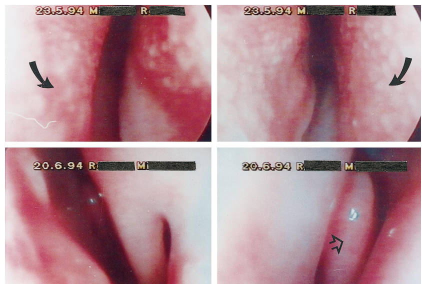
Figure 2. Typical rigid endoscopic views of the nasal mucosa of a patient with allergic rhinitis, before (top), and after (bottom) treatment. Top: edematous congestion of the inferior turbinates (arrows). Small drops of mucoid discharge are scattered on the septal (curved arrows) and turbinates' hyperemic mucosa. Bottom: endoscopic views of the nose of the same patient after successful phototherapy. The inferior turbinate (arrow), the middle turbinate (empty arrow) and the nasal mucosa appear normal.

There were no significant differences in gender or age between patients in the study and the placebo groups. The degrees of severity of symptomatology prior to treatment of the patients with allergic rhinitis in the study and placebo groups are summarized in Tables 1 and 2, respectively. Nasal obstruction caused by edematous congestion of the inferior turbinates was the most common pretreatment finding on nasendoscopic examination (Tables 1 and 2, Figs 2 and 3). In second place among the findings clearly observed by the rigid endoscope were droplets of mucoid or watery discharge scattered on the septal and turbinate mucosa (Figs 2 and 3). These findings, together with streaks of mucoid dis-